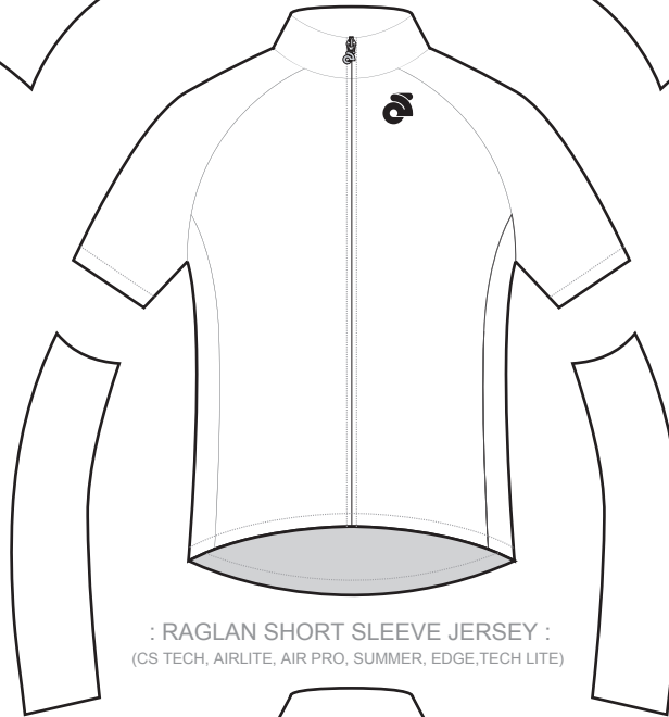
: RAGLAN SHORT SLEEVE JERSEY : (CS TECH, AIRLITE, AIR PRO, SUMMER, EDGE, TECH LITE)