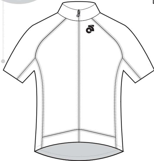
: APEX Razor Jersey : (MSJ104)